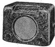
Front View of D.A.C. 90 Receiver

MAINS PORTABLE for A.C. or D.C. Supply MODEL D.A.C.90